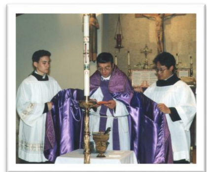
Blessing of the Baptismal Water