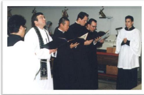
Intoning of the Gospel