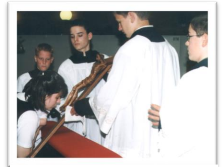
Ecce Signum Crucis