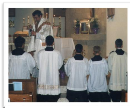
Domine non sum dignus

Click on pictures to see larger versions