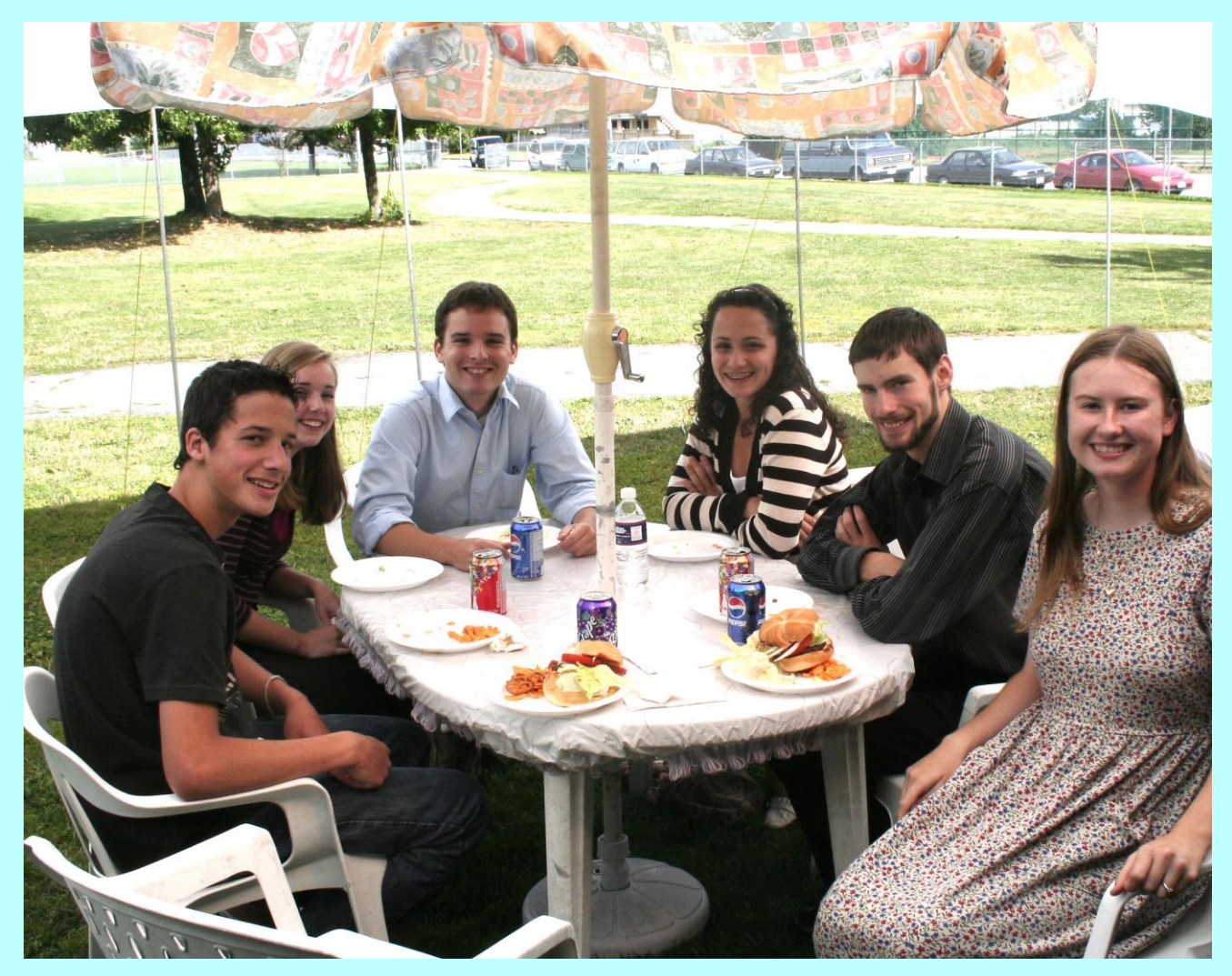
Who says kids don't attend Mass anymore no nostalgia here