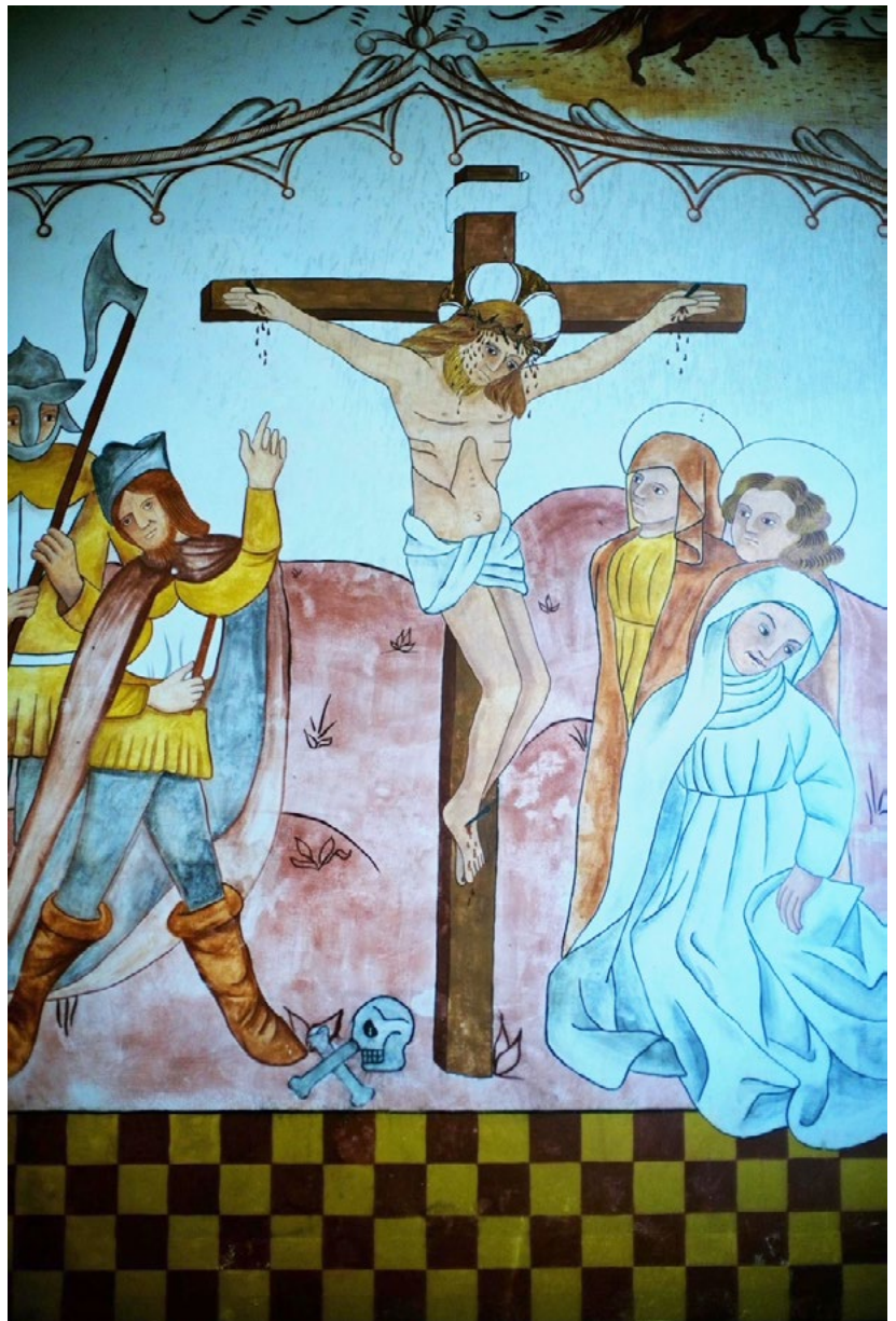
Wall painting at St Teilo's Church. To see more photos roll the mouse cursor along the red arrow track (works in Adobe Acrobat and Adobe Viewer).