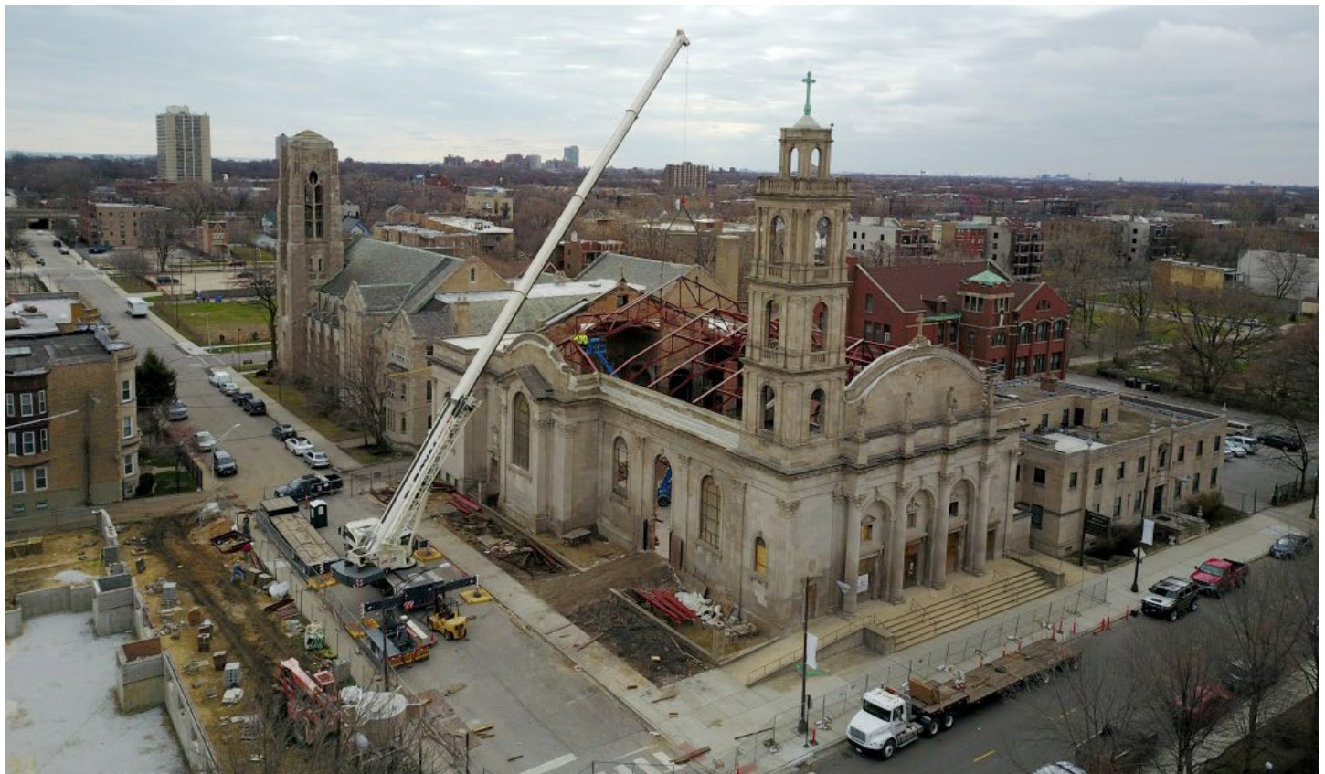
Restoration of Christ the King, Chicago. After a fire devastated the church of Christ the King, home of the Institute of Christ the King in the United States, in October 2015, work has been underway to rebuild the shrine. Here is a video of current progress.