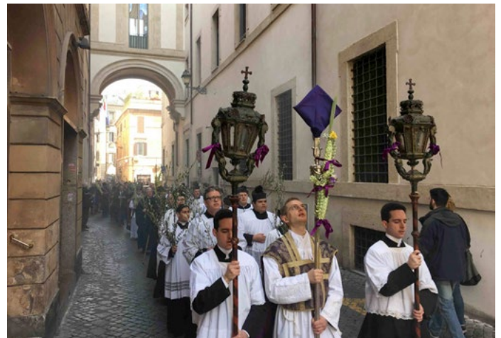
Folded chasuble, FSSP

Thus we find, in what was officially described as the 'Restored Holy Week' of 1955, entirely new elements such as the recitation of the Pater Noster in unison, in the vernacular, on Good Friday, and the 'renewal of baptismal promises' during the Easter Vigil. Many genuinely ancient features, on the other hand, were lost, such as the use of folded chasubles, a very ancient feature of the Roman Rite on penitential days.