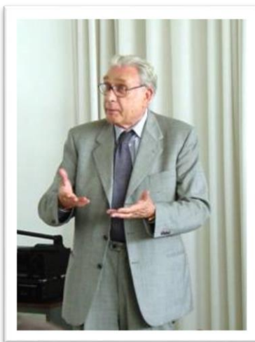
Count Neri Capponi