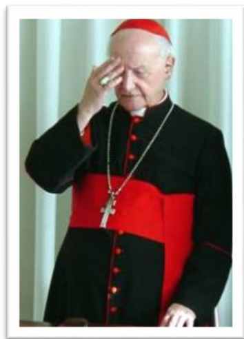
Alfons Cardinal Stickler